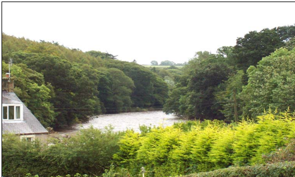
VIEWS OVER THE RIVER

Brydekirk is a beautiful small country Village only a few miles from Annan, with a variety of sporting pursuits such as Salmon Fishing, Golf etc. Lovely peaceful river walks & many attractions can be found nearby.